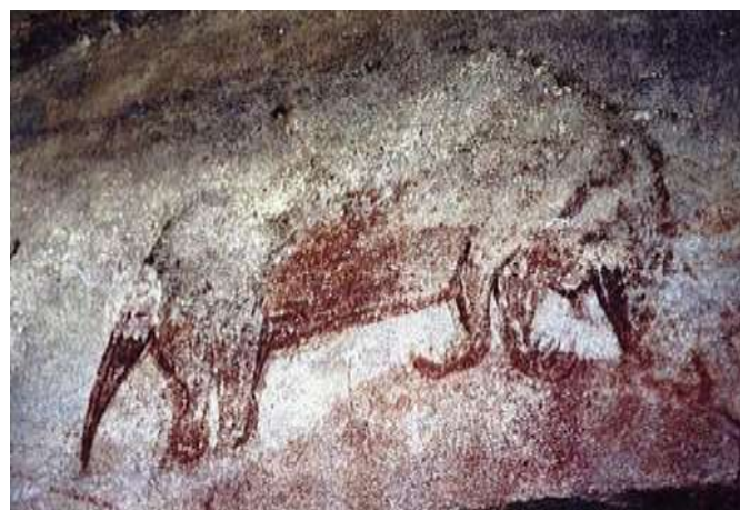
Aboriginal rock art from Arnhem Land in Australia depicting the long, down-curved beak

Echidnas are powerful diggers, using their clawed front paws to dig out prey and create burrows for shelter. They may rapidly dig themselves into the ground if they cannot find cover when in danger.