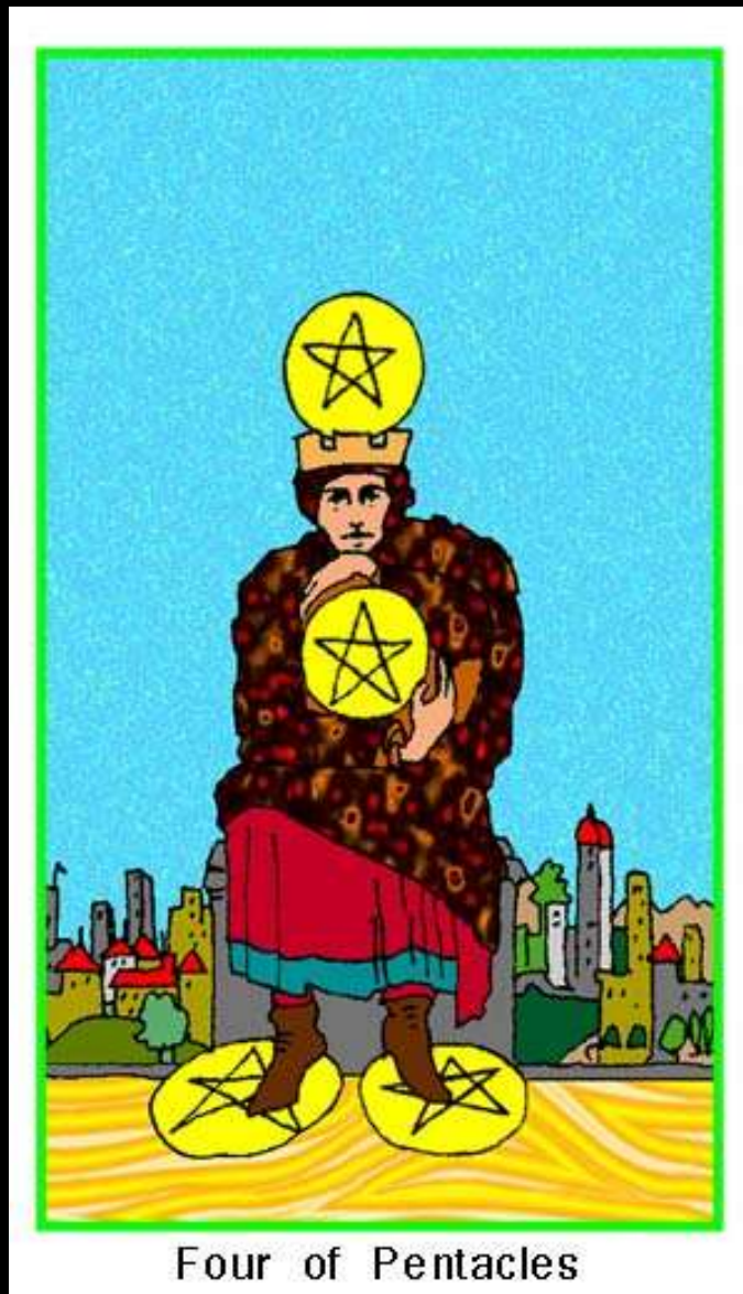
Four of Pentacles